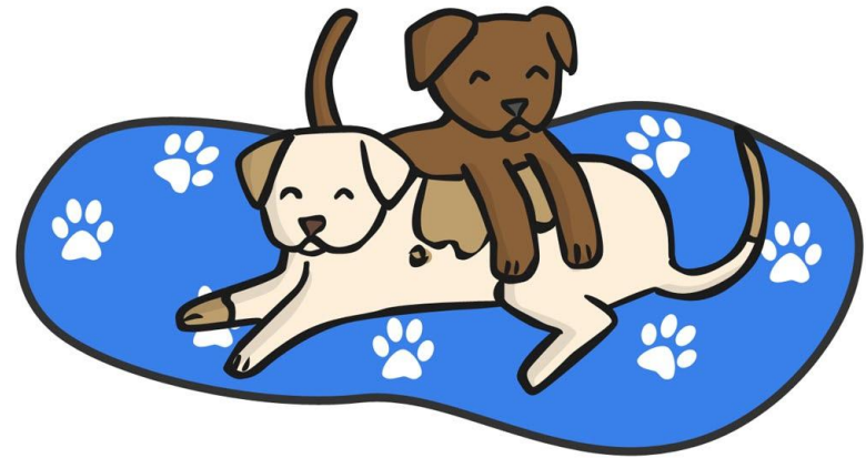
The puppies' bed