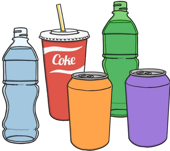
The girls' drinks