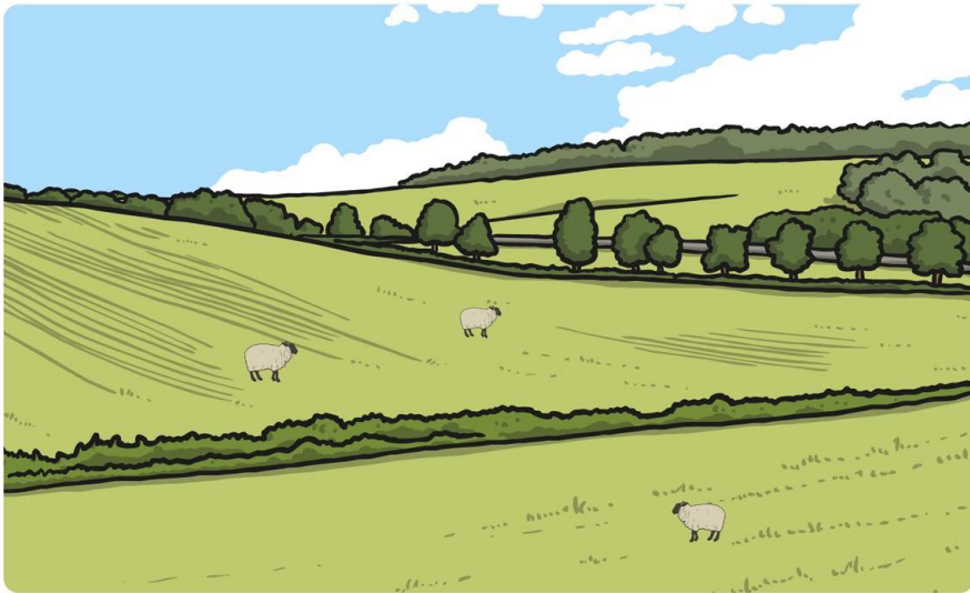
The sheep's field