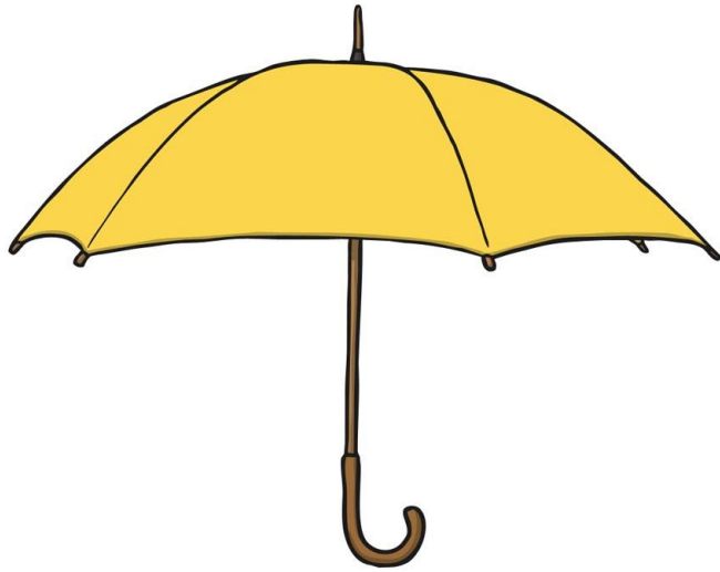
The boy's umbrella (The umbrella of the boy)