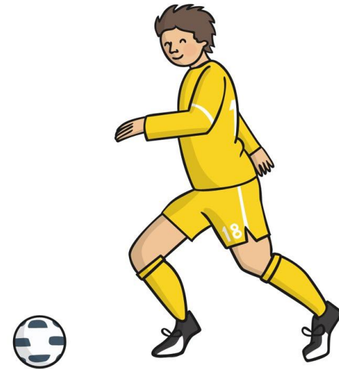
The men's football match